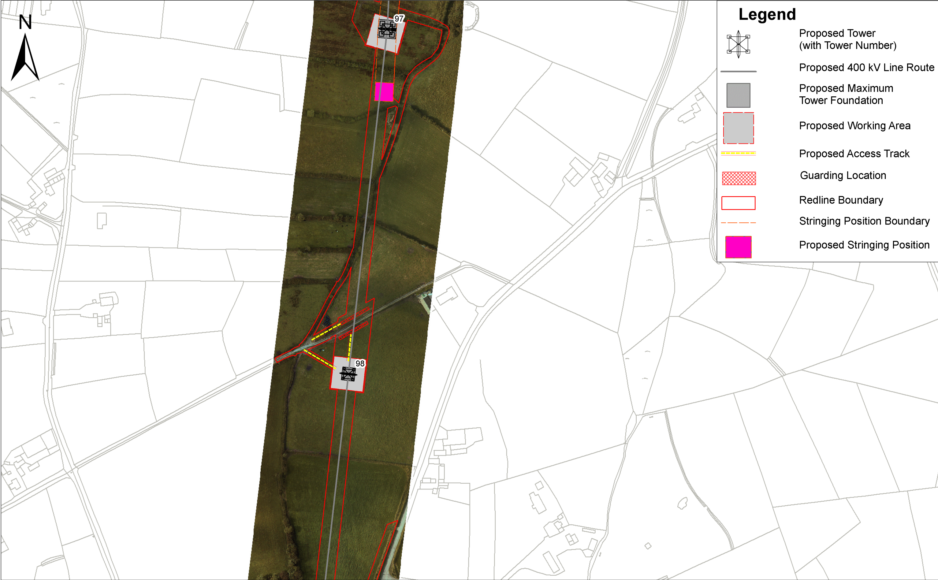
View 1: 1/2,500